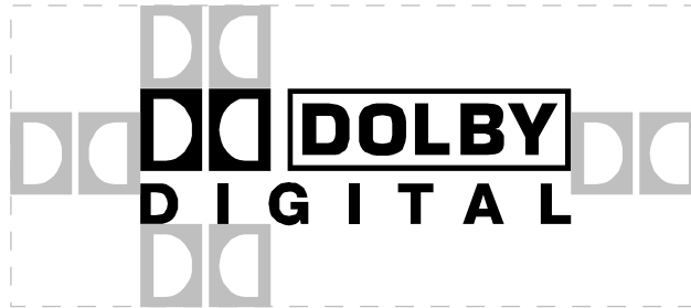
Figure 1 “Clear Area” for Dolby Logo

Logos should be placed on packaging and discs as shown in Figure 2.