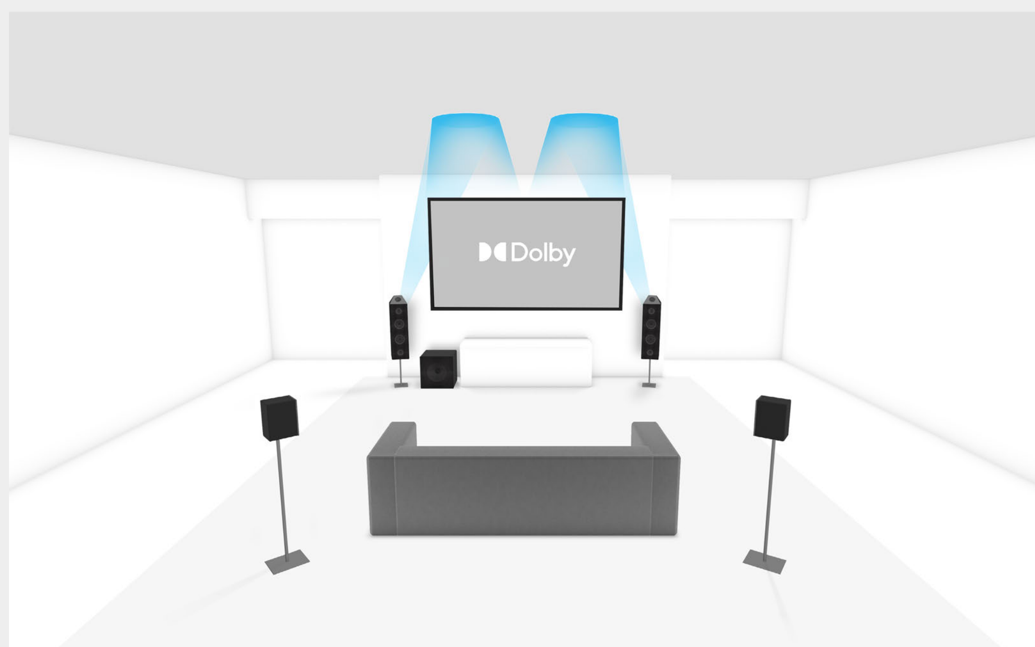
PERSPECTIVE DETAIL FOR 4.1.2 SETUP

This refers to how many overhead or Dolby Atmos enabled speakers you can use in your Dolby Atmos capable setup.