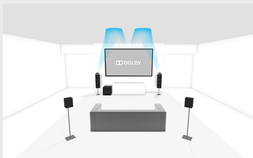
Perspective detail for 4.1.2 setup

This refers to how many overhead or Dolby Atmos enabled speakers you can use in your Dolby Atmos capable setup.