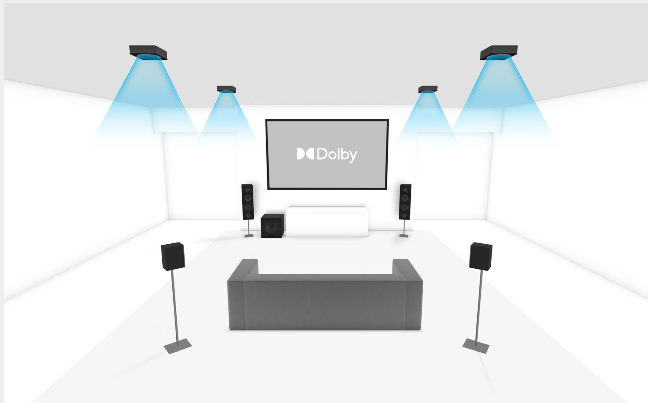
PERSPECTIVE DETAIL FOR 4.1.4 SETUP