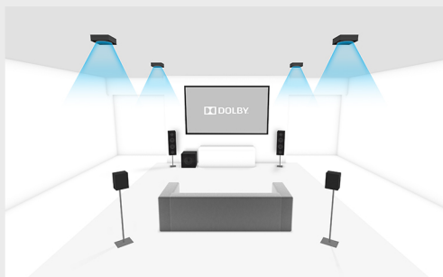
Perspective detail for 4.1.4 setup

This refers to how many overhead or Dolby Atmos enabled speakers you can use in your Dolby Atmos capable setup.