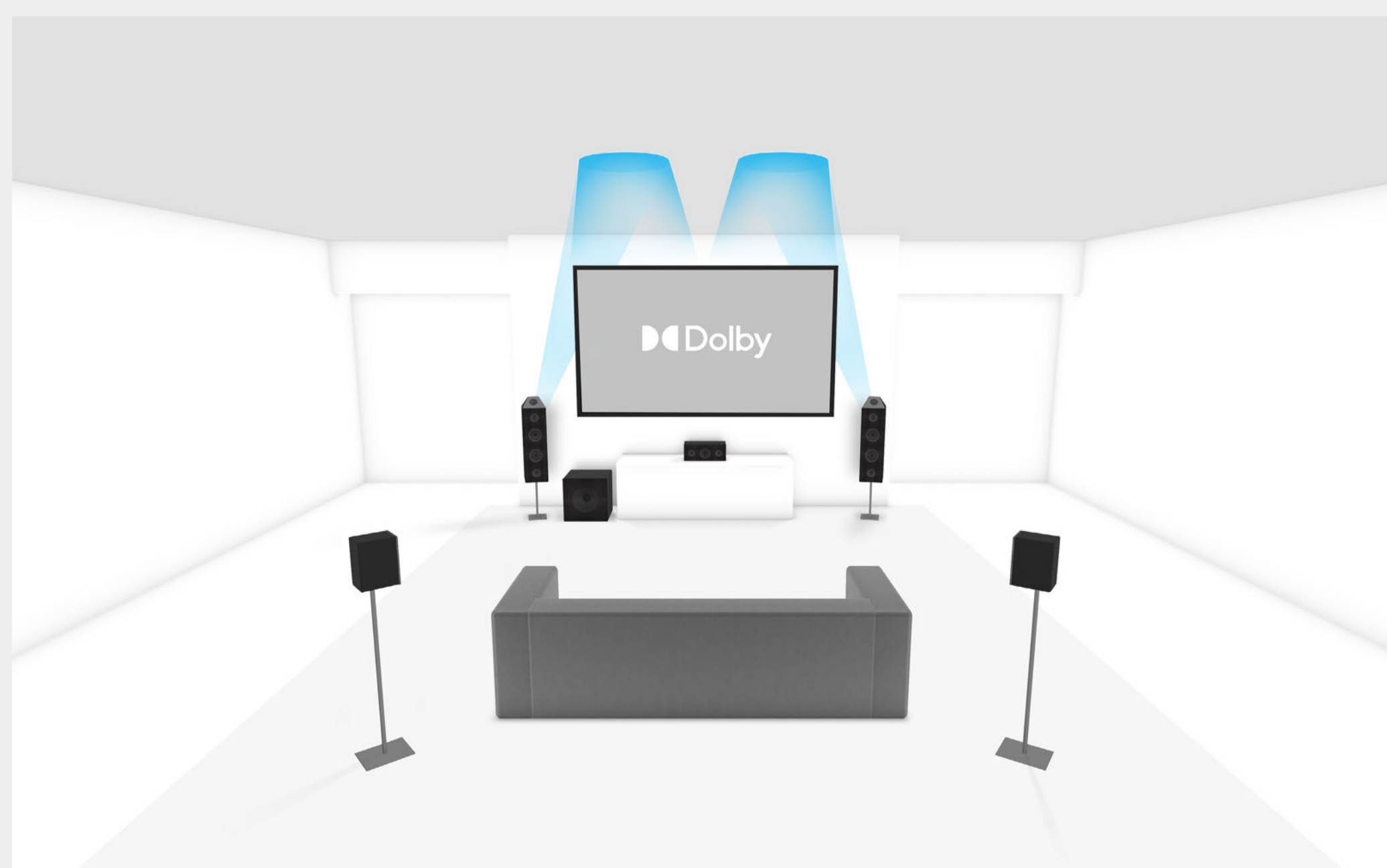
PERSPECTIVE DETAIL FOR 5.1.2 SETUP

This refers to how many overhead or Dolby Atmos enabled speakers you can use in your Dolby Atmos capable setup.