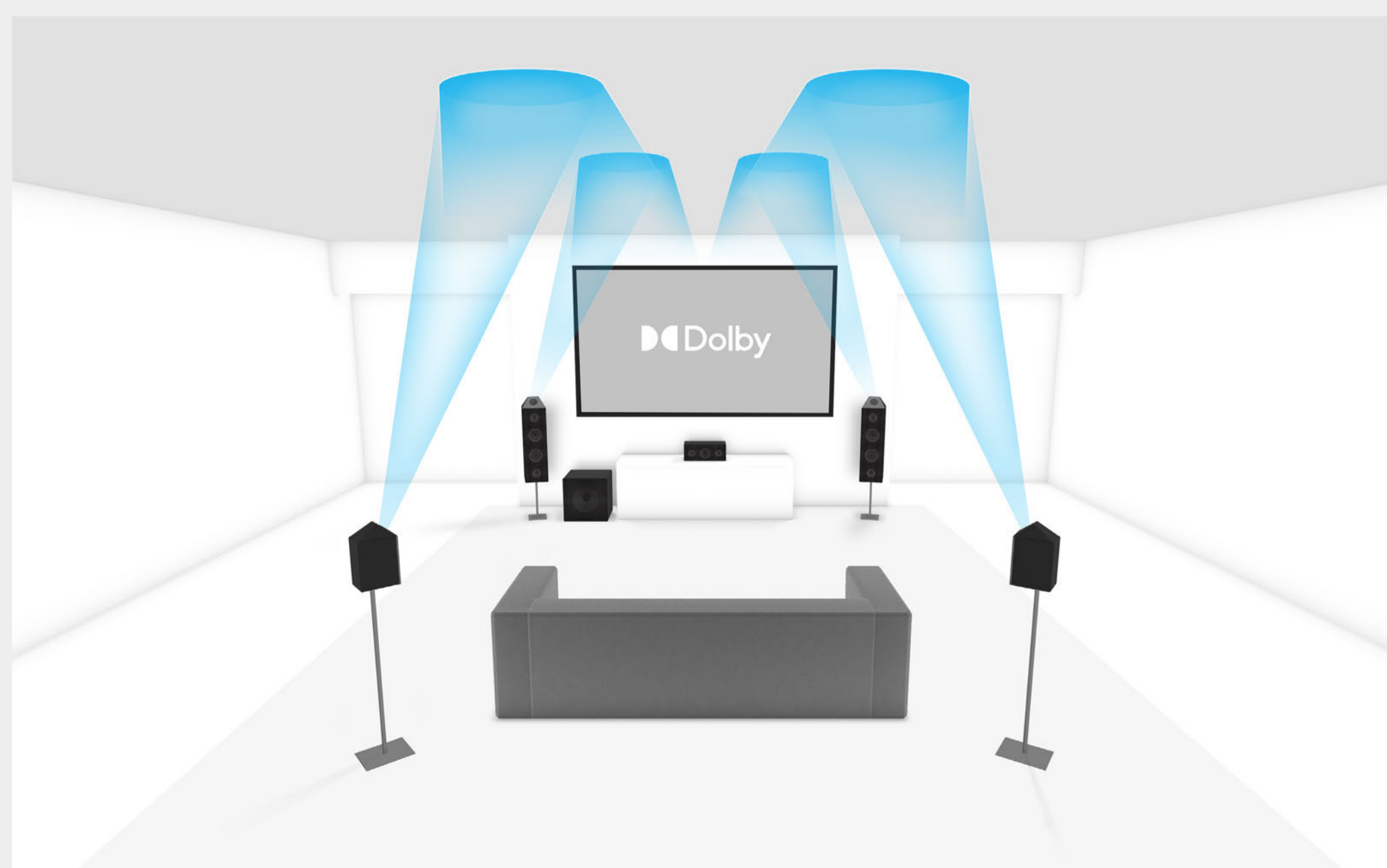
PERSPECTIVE DETAIL FOR 5.1.4 SETUP

This refers to how many overhead or Dolby Atmos enabled speakers you can use in your Dolby Atmos capable setup.