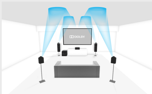
Perspective detail for 5.1.4 setup

This refers to how many overhead or Dolby Atmos enabled speakers you can use in your Dolby Atmos capable setup.