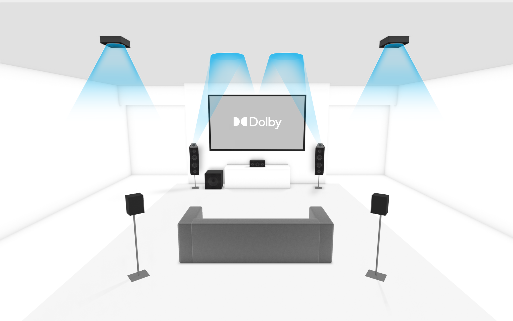
PERSPECTIVE DETAIL FOR 5.1.4 SETUP

This refers to how many overhead or Dolby Atmos enabled speakers you can use in your Dolby Atmos capable setup.