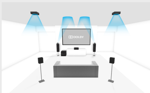
Perspective detail for 5.1.4 hybrid setup

This refers to how many overhead or Dolby Atmos enabled speakers you can use in your Dolby Atmos capable setup.