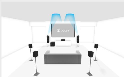
Perspective detail for 7.1.2 setup

This refers to how many overhead or Dolby Atmos enabled speakers you can use in your Dolby Atmos capable setup.