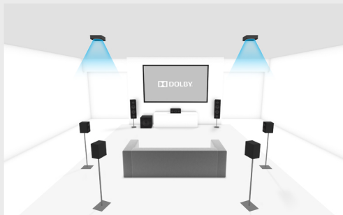
Perspective detail for 7.1.2 setup

This refers to how many overhead or Dolby Atmos enabled speakers you can use in your Dolby Atmos capable setup.