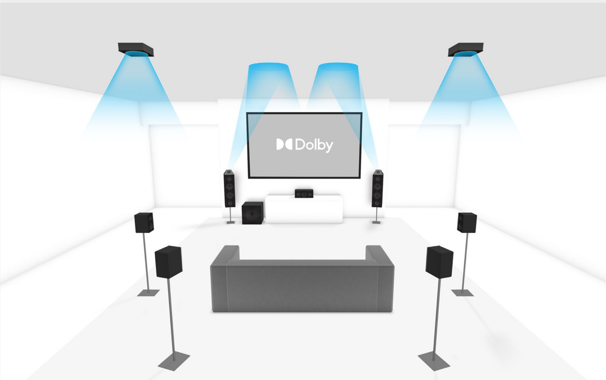
PERSPECTIVE DETAIL FOR 7.1.4 SETUP