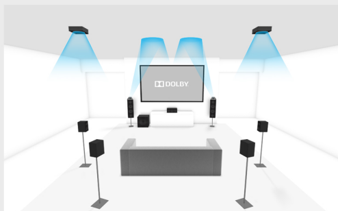
Perspective detail for 7.1.4 hybrid setup

This refers to how many overhead or Dolby Atmos enabled speakers you can use in your Dolby Atmos capable setup.