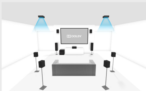
Perspective detail for 7.1.6 setup

This refers to how many overhead or Dolby Atmos enabled speakers you can use in your Dolby Atmos capable setup.