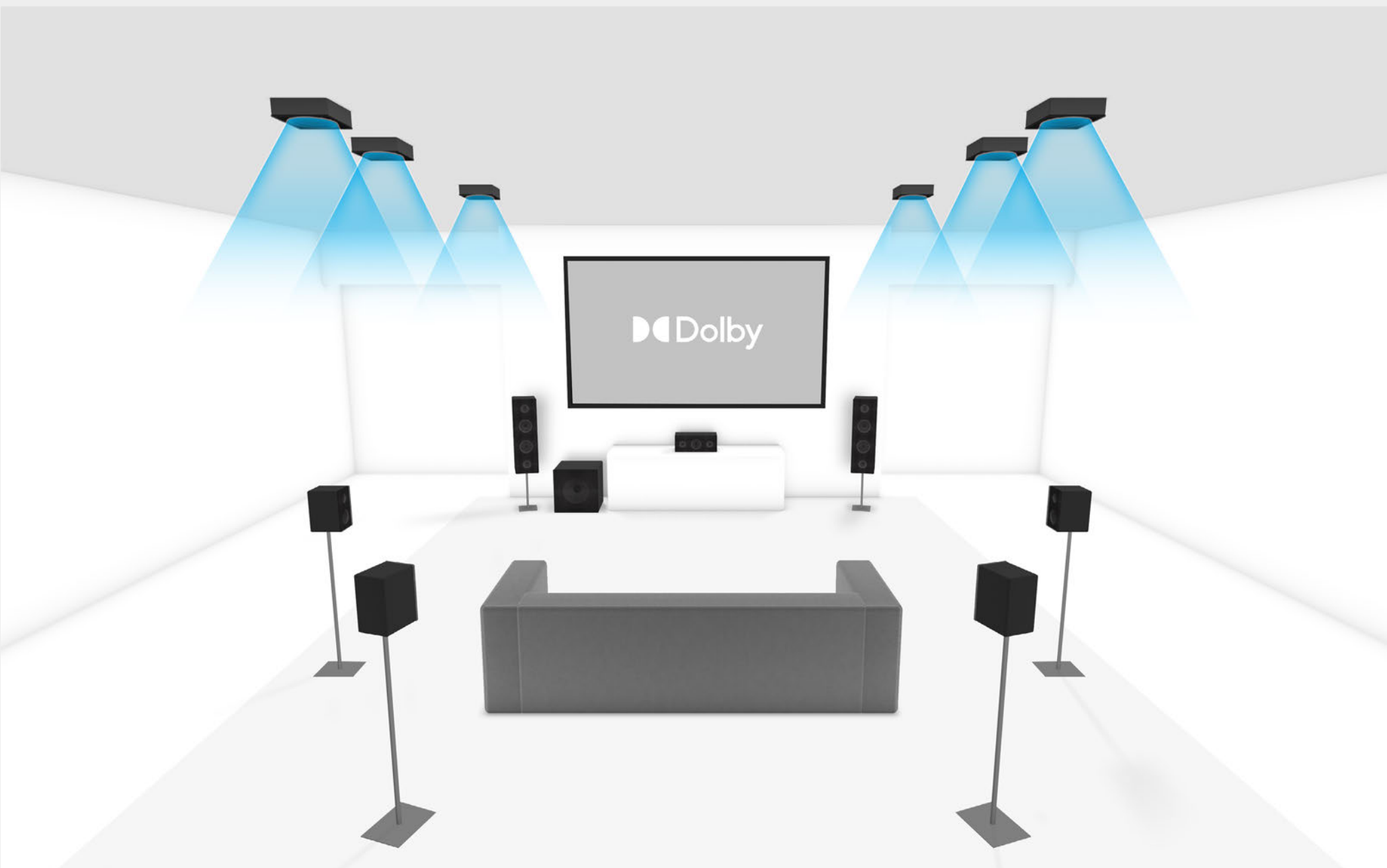
PERSPECTIVE DETAIL FOR 7.1.6 SETUP

This refers to how many overhead or Dolby Atmos enabled speakers you can use in your Dolby Atmos capable setup.