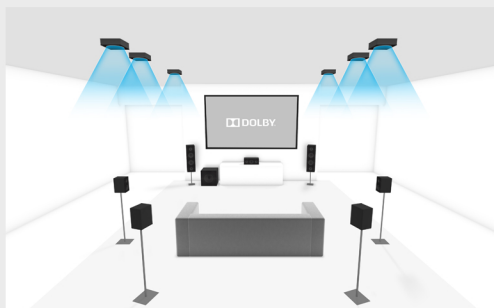
Perspective detail for 7.1.6 setup

This refers to how many overhead or Dolby Atmos enabled speakers you can use in your Dolby Atmos capable setup.