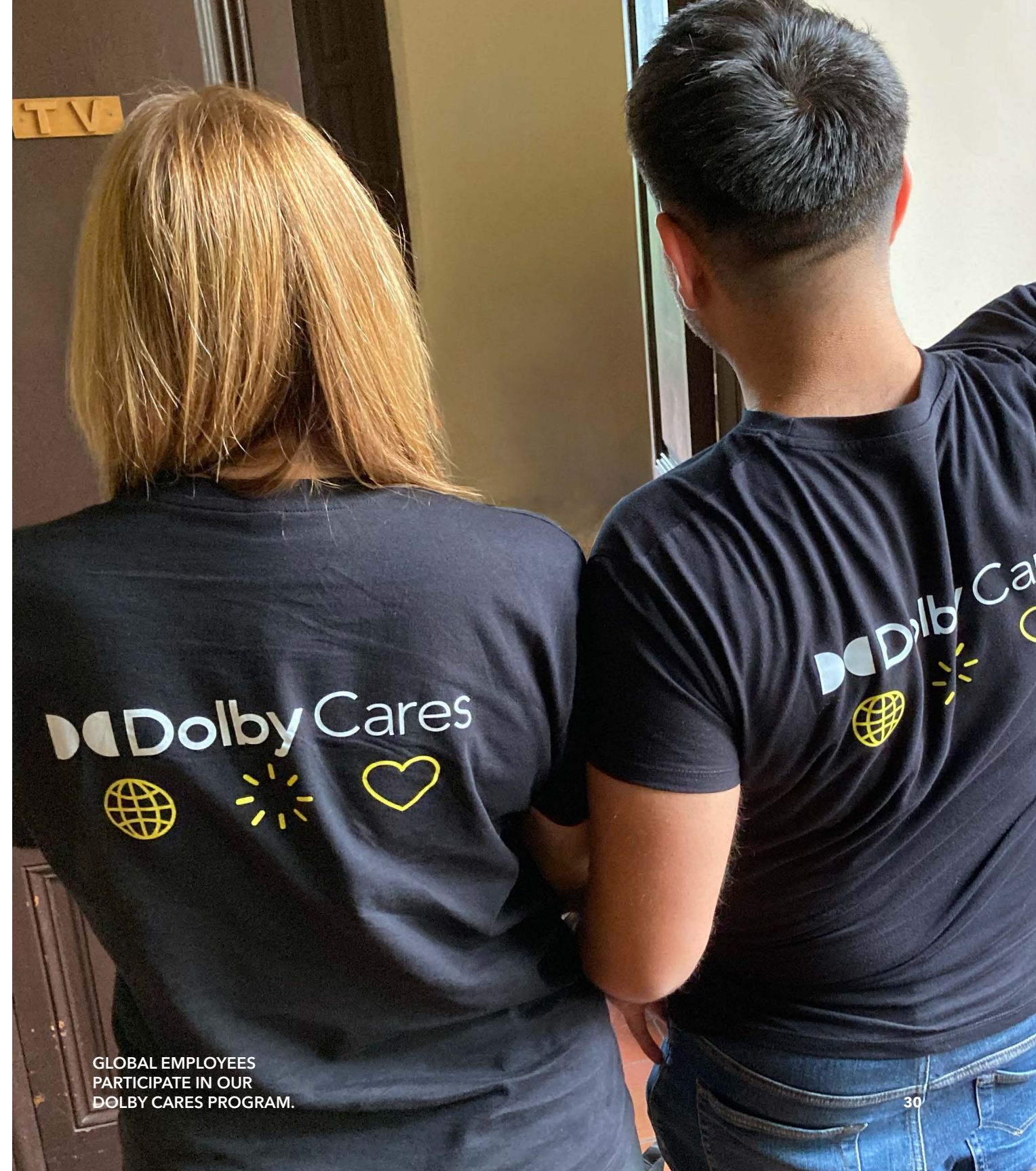
GLOBAL EMPLOYEES PARTICIPATE IN OUR DOLBY CARES PROGRAM.

The use of “material” or “materiality” in this report is not intended to convey matters or facts that could be deemed “material” to a reasonable investor as referred to under U.S. securities laws or similar requirements of other jurisdictions, and we are not using these terms as they are used in the context of financial statements or financial and regulatory reporting.