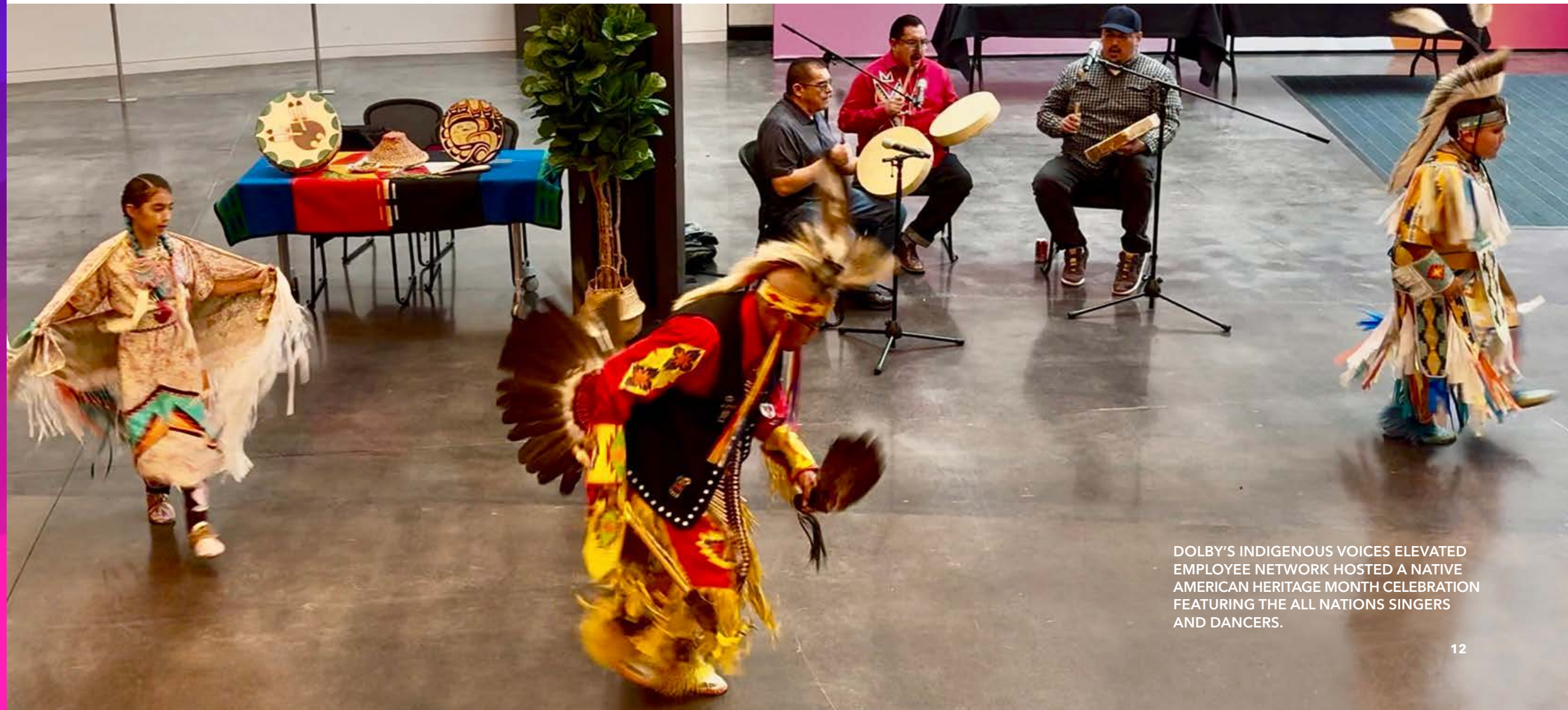
DOLBY'S INDIGENOUS VOICES ELEVATED EMPLOYEE NETWORK HOSTED A NATIVE AMERICAN HERITAGE MONTH CELEBRATION FEATURING THE ALL NATIONS SINGERS AND DANCERS.

OVER 200 EMPLOYEES PARTICIPATED IN INCLUSIVE HIRING TRAINING