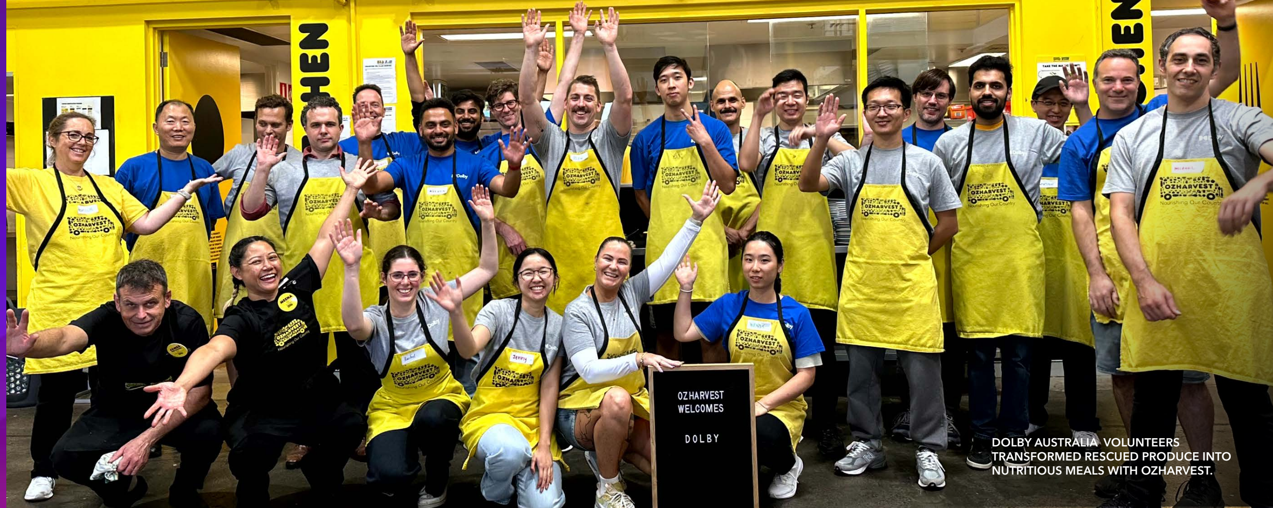
DOLBY AUSTRALIA VOLUNTEERS TRANSFORMED RESCUED PRODUCE INTO NUTRITIOUS MEALS WITH OZ HARVEST.