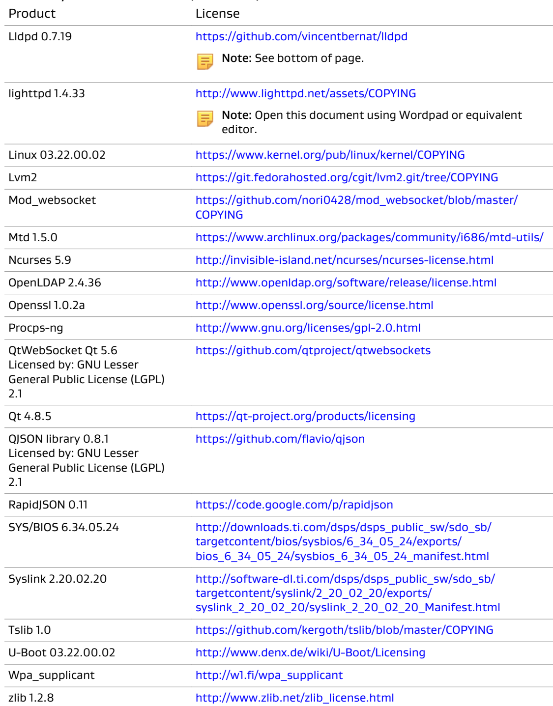
Table 1: Open source software (continued)