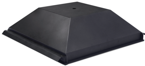
RCT-24 Recessed Ceiling kit